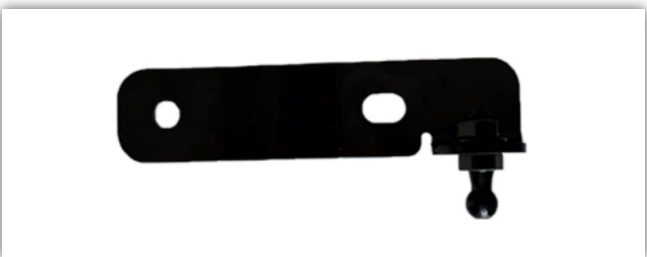
RH upper mounting bracket 1