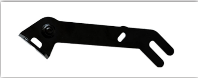
RH lower mounting bracket 1