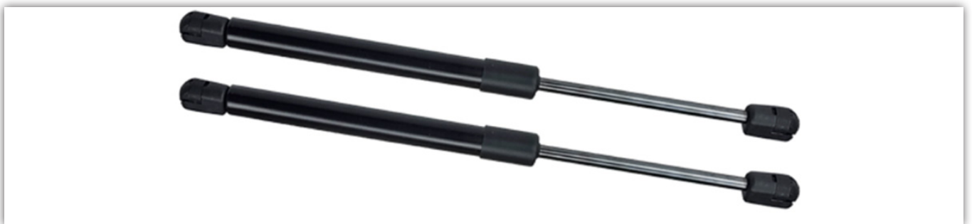
Gas strut 2