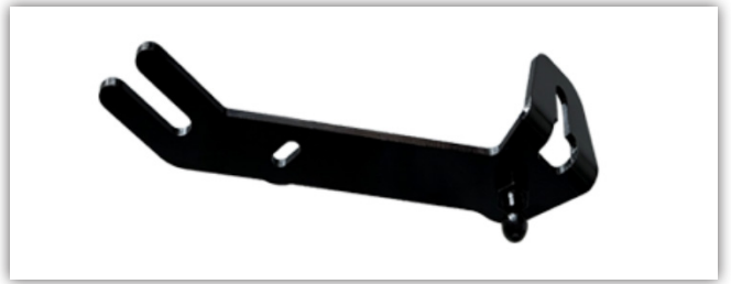
RH lower mounting bracket 1