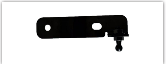
RH upper mounting bracket 1