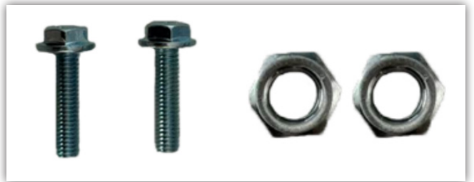
Bolt 2 Nut 2